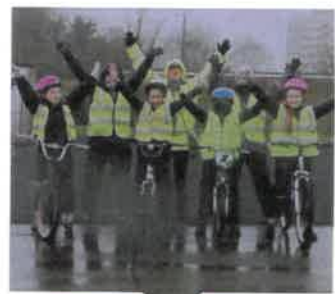
LEARN TO RIDE